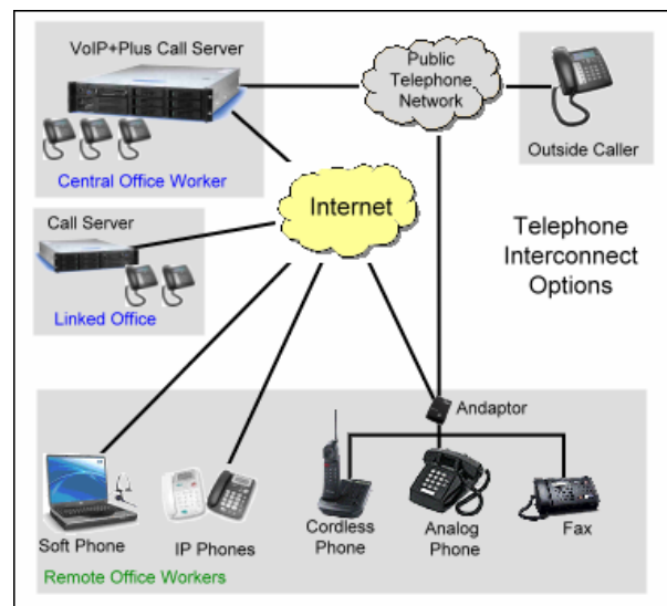
Diagram Showing All Connection Options